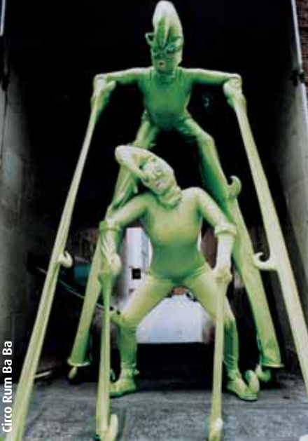
Circo Rum Ba Ba

Saturday 23rd August 12.30pm onwards Kidderminster High Street (top)