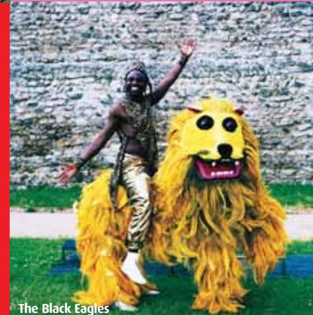
The Black Eagles

Admission by ticket only £3/£1.50 concession